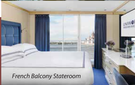
French Balcony Stateroom